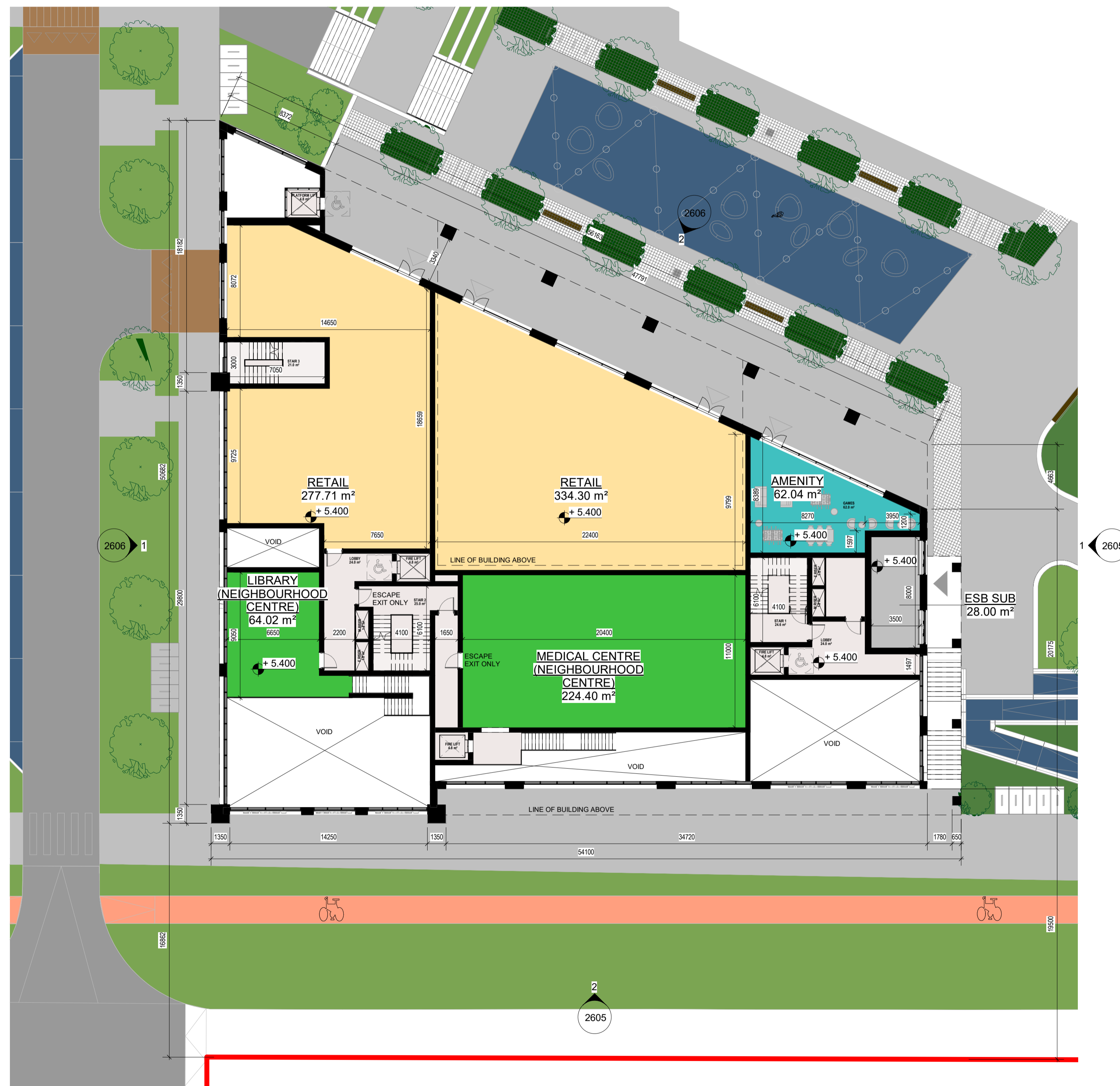
1 PLAN - BLOCK C - LEVEL 00 1 : 200

Please consider the environment before printing this sheet